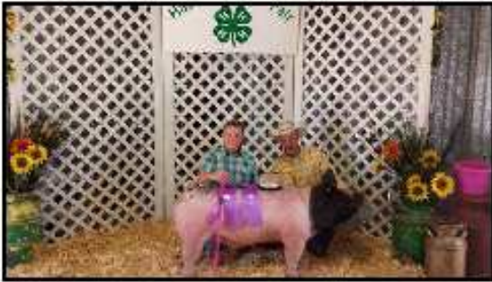
Grand Champion 2014 Haskell County Fair Bred by Western Plains Genetic