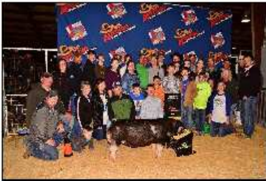
Reserve Champion Spot 2015 San Antonio Livestock Show Bred by Reiss Livestock